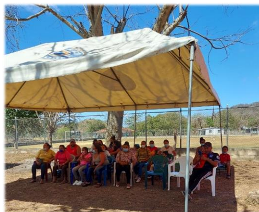
The waiting room