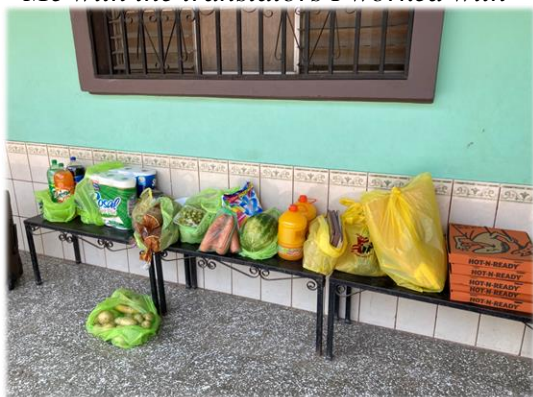
Some of the food taken to the orphanage. Gave them pizza for dinner, a real treat!