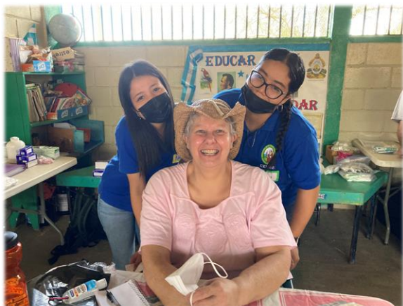
Me with the translators I worked with

People of First Church, this is what YOU have done. I was only the facilitator and I thank you for the chance to do so.