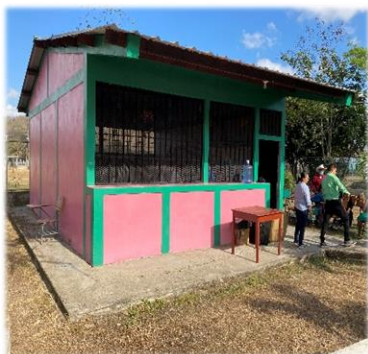
One of the "clinics" we worked out of