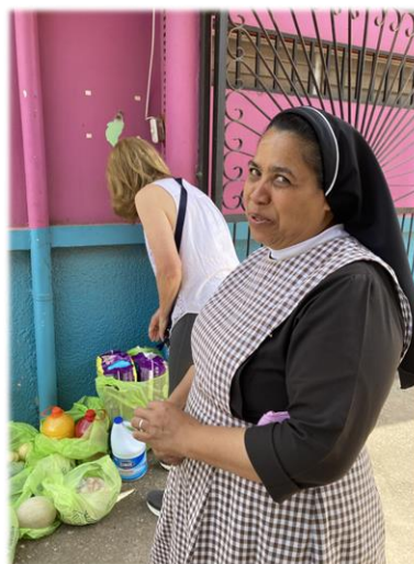
One of the nuns that works at the orphanage.