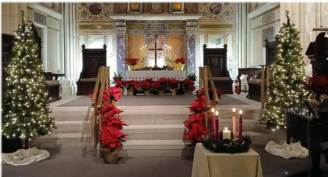
Christmas Eve 2025