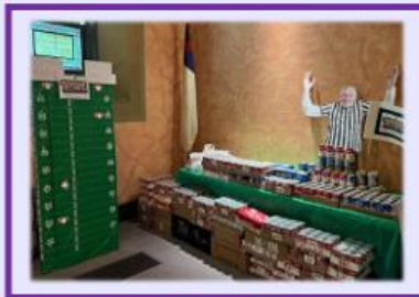
Improving Our Community