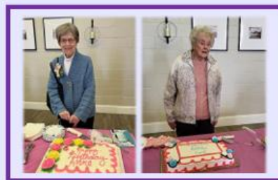
Caring for Each Other