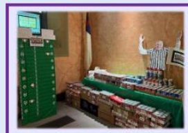
Improving Our Community