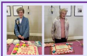
Caring for Each Other