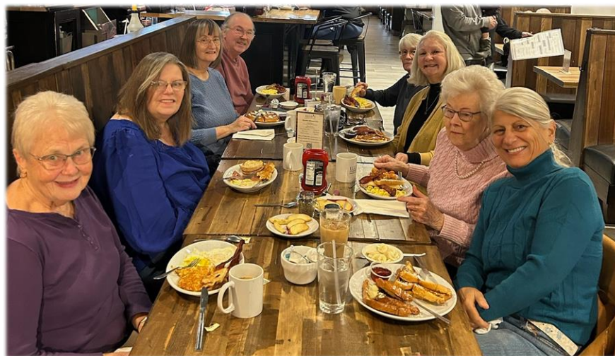
Breakfast Group from November