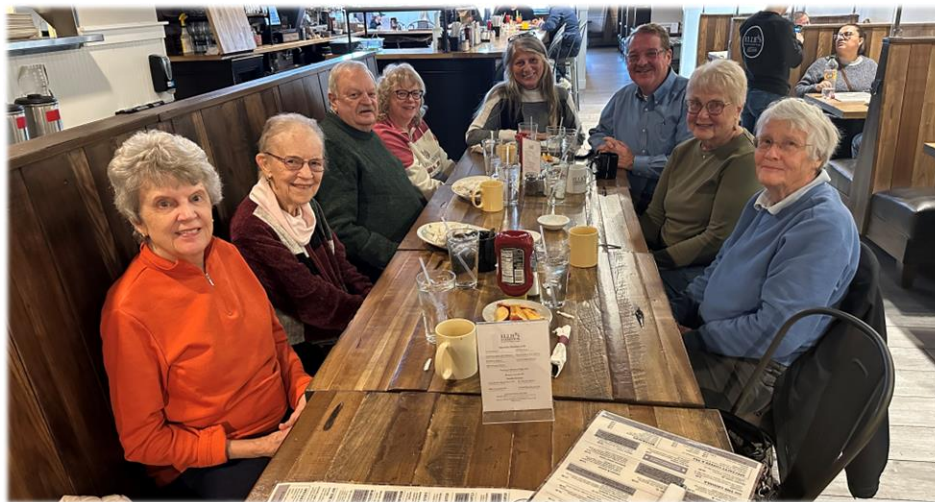
Breakfast Group from November