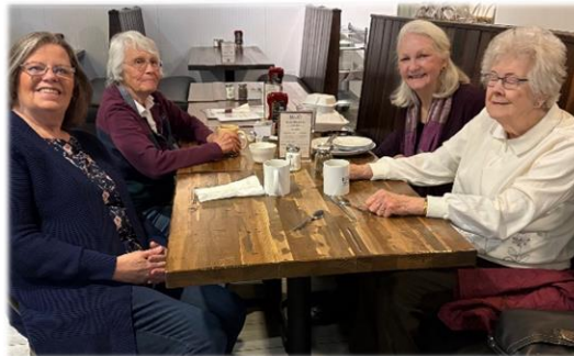
Breakfast Group from March

If you have never joined us, we extend a special welcome to you. No reservation needed. Join us, even if you are not a breakfast eater, for this fellowship opportunity. We'd love to see you!