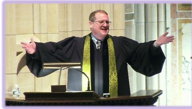
You Are Welcome Here!

For those who cannot attend in person, worship will continue to be broadcast each Sunday, at 10:00 AM, on Facebook Live ( facebook.com/FirstChurchMethuen ). It will also be posted following the worship service on our YouTube channel ( www.youtube.com/channel/UCfLSjhXs9UG8yC89aB8evrA ).