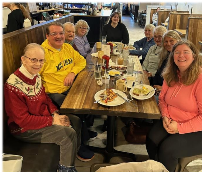
Breakfast Group from January